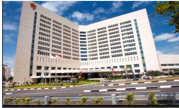
TAN TOCK SENG HOSPITAL Stainless Steel Welded Ductwork/Hot Dipped Galvanized Ductwork