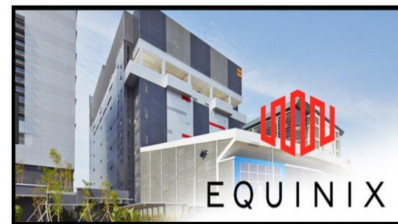
Equinix Hot Dipped Galvanize Ductwork