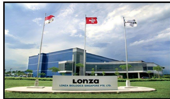
Lonza Hot Dipped Galvanize Ductwork