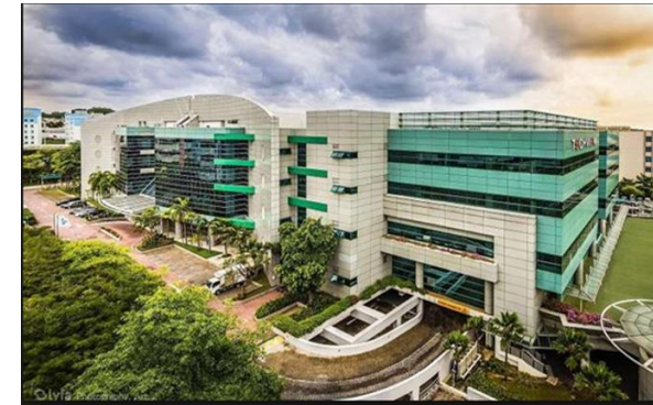
BIOTRONIK Stainless Steel Welded Ductwork