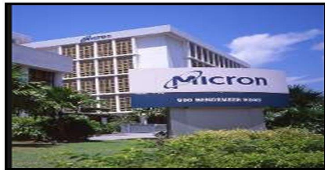
Micron Hot Dipped Galvanize Spiral Ductwork